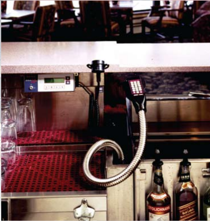
All-Bottle ID™ installation