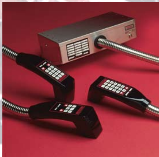
Laser™ model dispensers