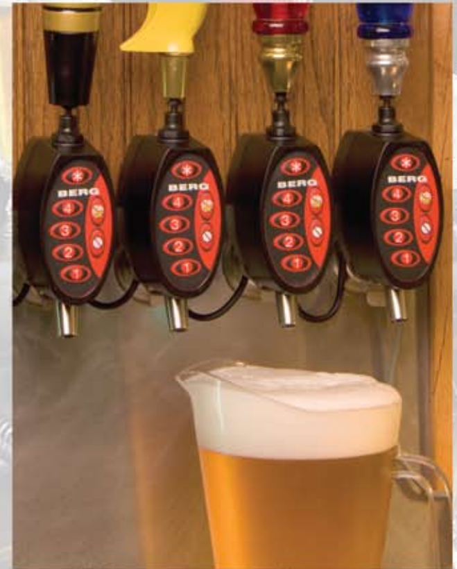
Tap 2 Draft beer bar area installation