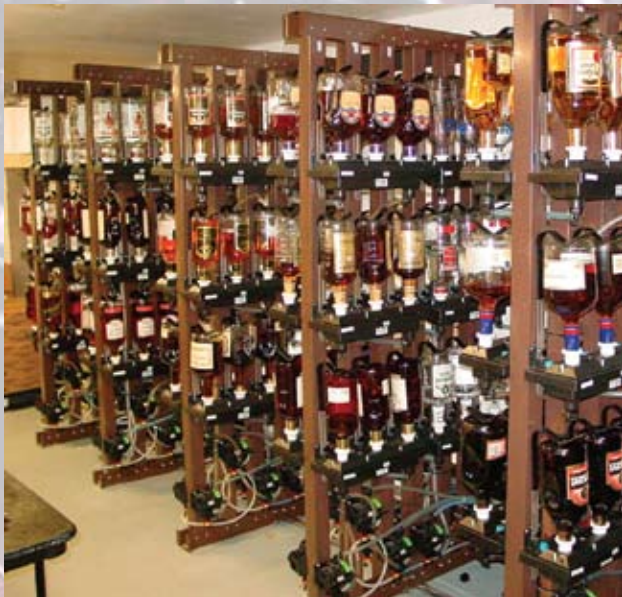
Laser™ Space Saver mounting racks