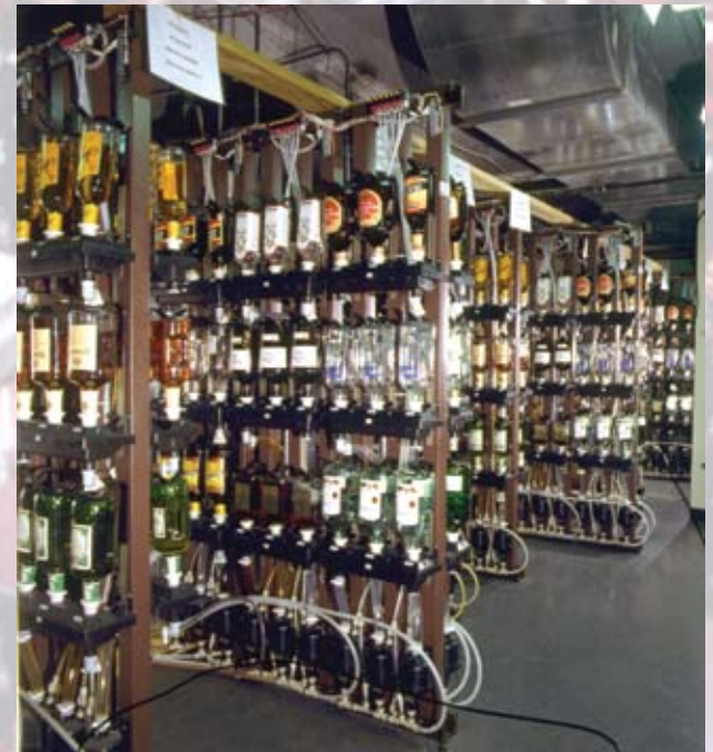
Laser™ Space Saver mounting racks