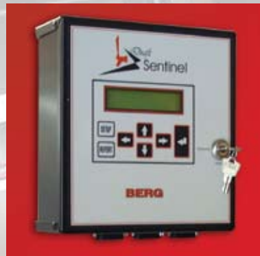
Sentinel Draft beer control console

The Flow meter is certified to NSF/ANSI Standard 18.