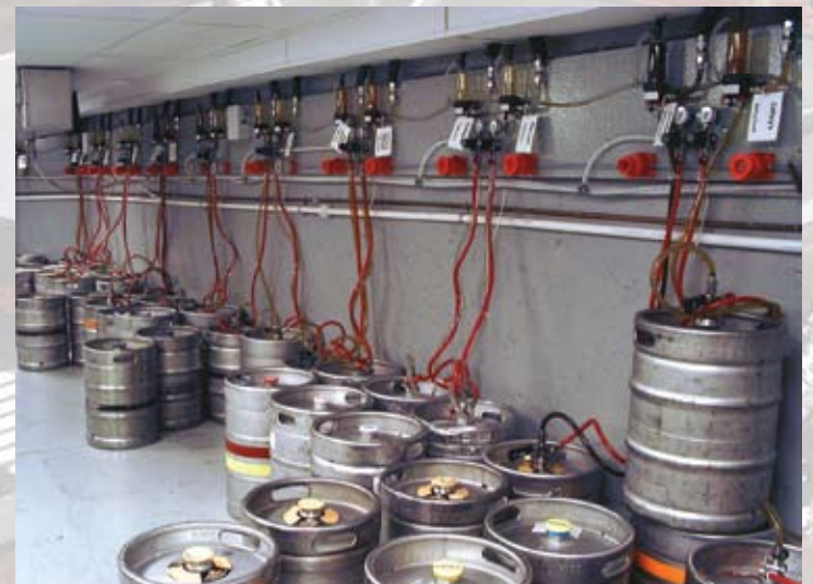
Tap 2 Draft beer supply room installation